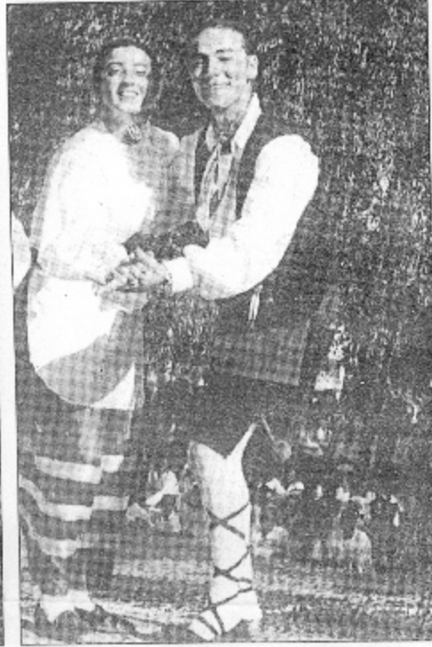
INTERNATIONAL: A group from Italy featured at the Millennium Festival